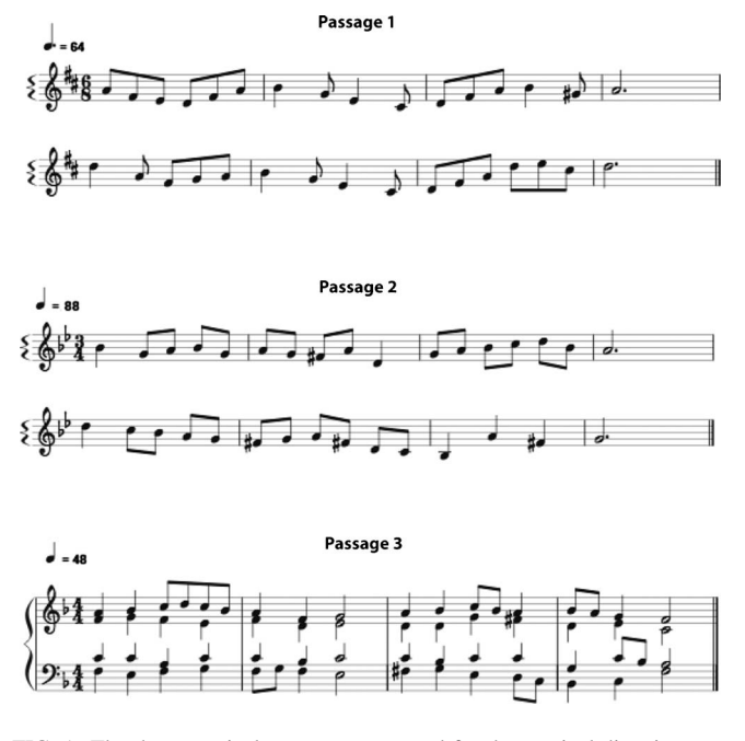
FIG. 1. The three musical passages presented for the musical dictation test. The first note of each passage was given for the melodic dictation passages, and the highest and lowest notes of the four-part harmony passage.

by Deutsch et al. (2006, 2009). This test consisted of successive presentations of the 36 tones spanning three octaves from C_3 (131 Hz) to B_5 (988 Hz), and subjects were asked to write down the name of each tone (C, F#, E; and so on) after they heard it. All tones were separated from temporally adjacent tones by an interval larger than an octave, in order to minimize the use of relative pitch in making judgments. The tones were piano tones of 500 ms duration, with 4.25-s interonset intervals; these were presented in three 12-tone blocks, with 39-s pauses between blocks. A practice block of four successive tones preceded the three test blocks. No feedback was provided at any time during the test.